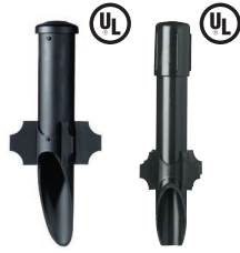
Landscape LightPost: Part Number: LLPN25B