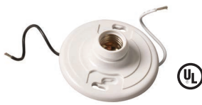
Part Number: 16524