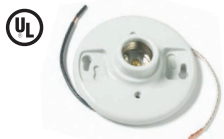
Part Number: 16520